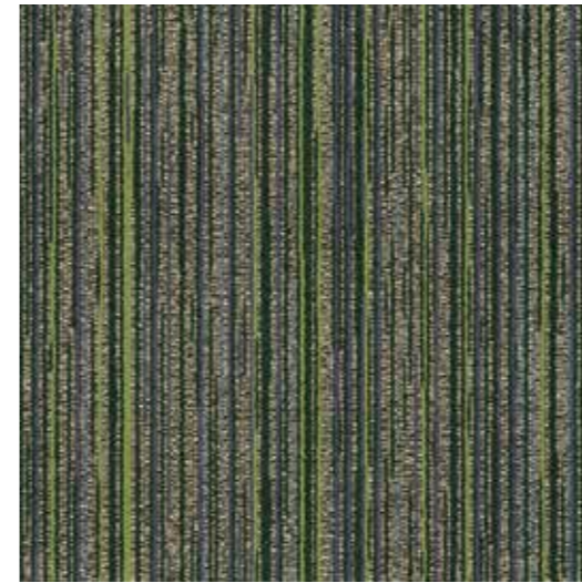
347003 Drawing Room