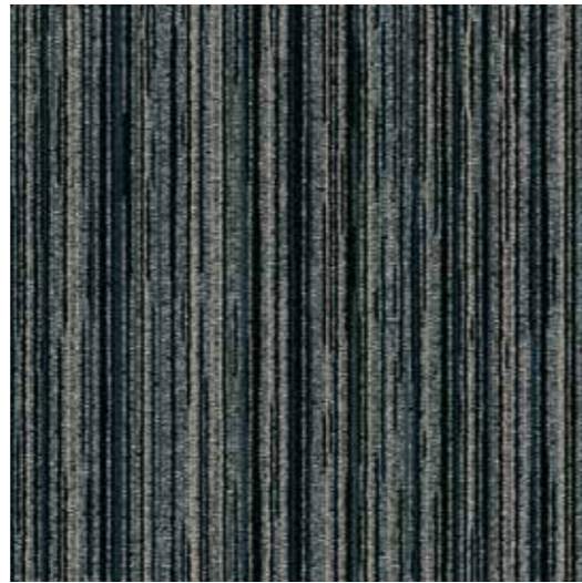
347002 Gate House