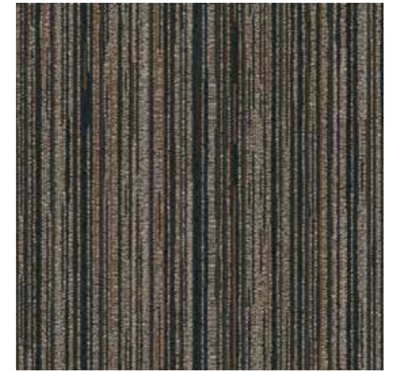
347004 Draw Bridge